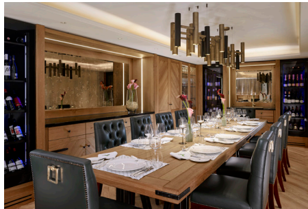
WINE CABINET – 21 sq. m

Our newest pride and joy. Executive meetings or raising a glass to a new venture – celebrate success in this fine fusion of form – architecture and content – wine.