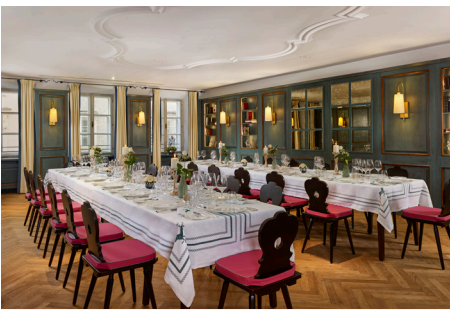
LIBRARY – 57 sq. m