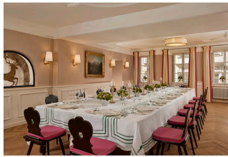
PINK SALON – 60 sq. m