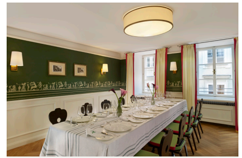
GREEN SALON – 23,5 sq. m