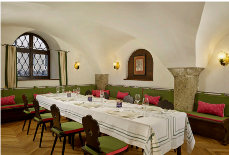
HUNTING SALON – 35 sq. m